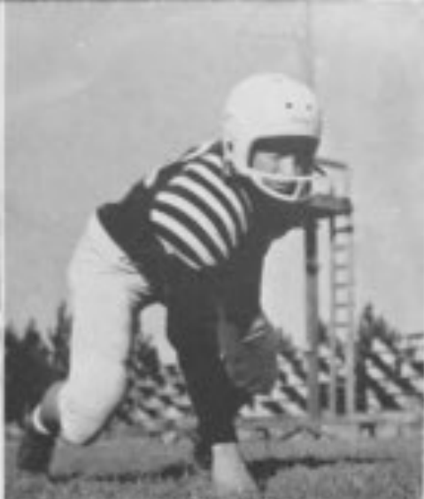
PHIL PHILLIPS Center